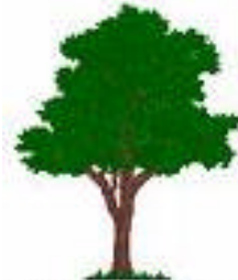
Earth Day - Every Day

Empty ink jet and toner cartridges and old cell phones are being collected to be recycled. They can be dropped off at any City Hall entrance, at the Streetsboro